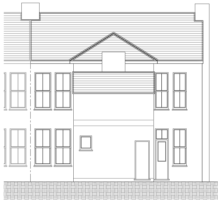
4 Existing Rear Elevation