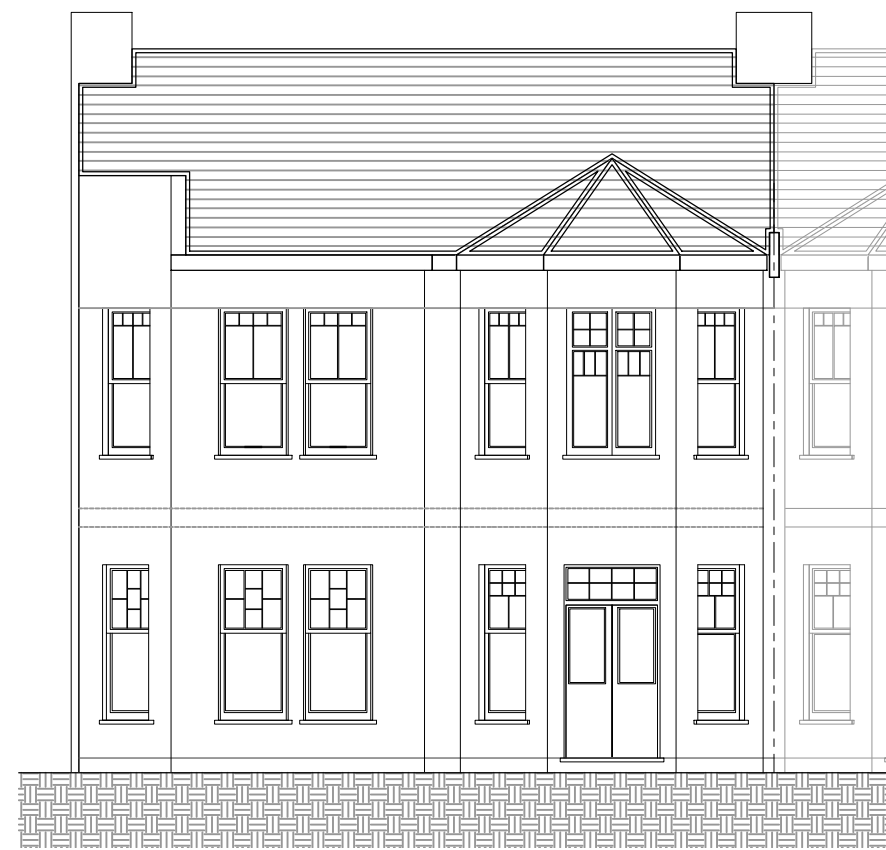
3 Existing Front Elevation