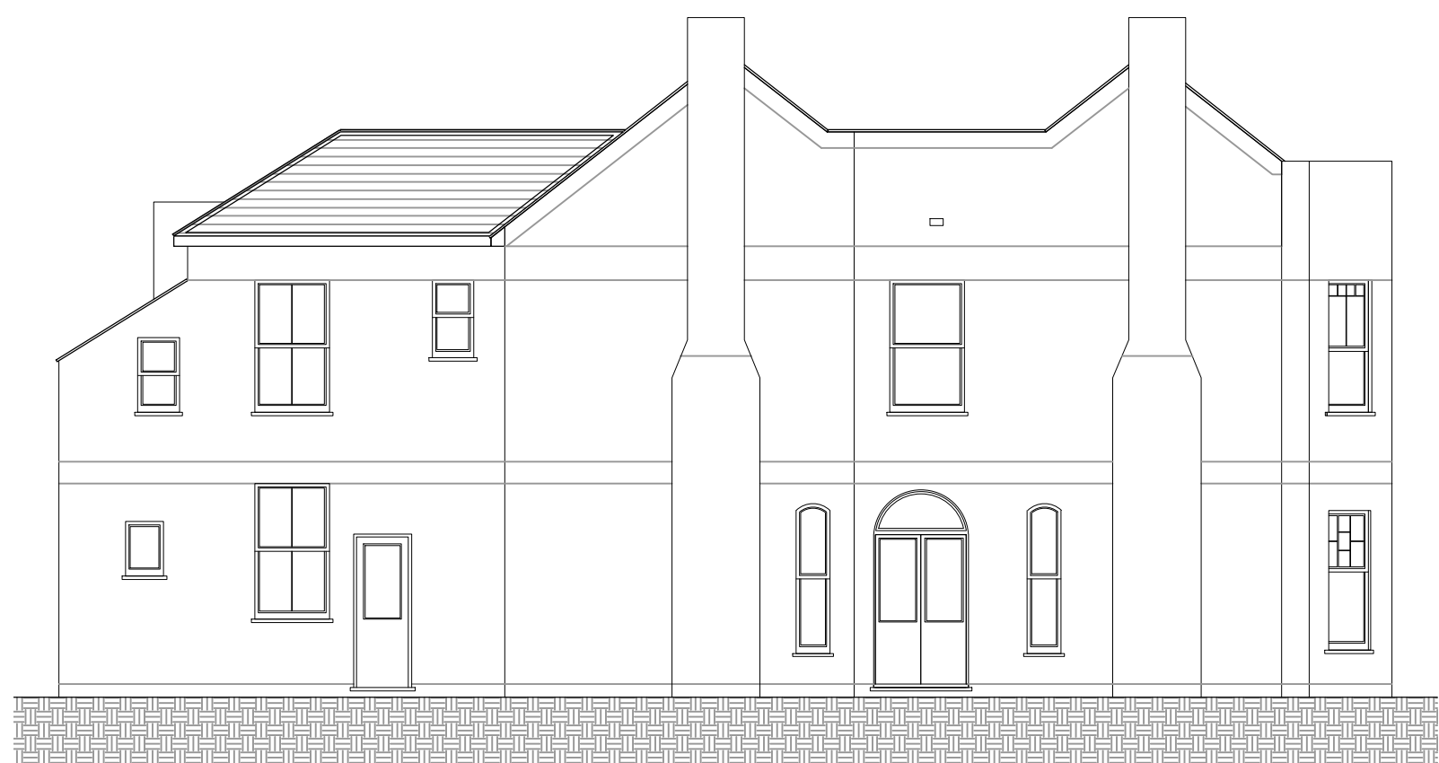
5 Existing Side Elevation